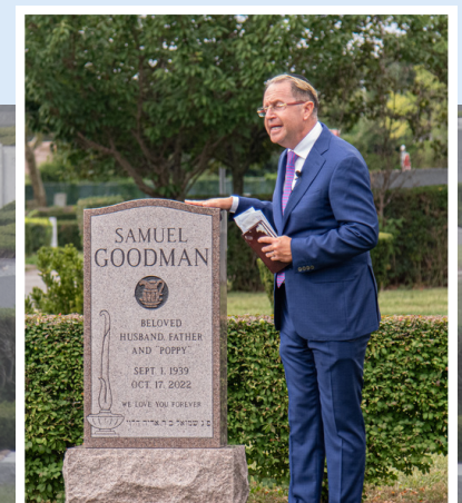
Remembering your loved one

In an era where physical distances and unforeseen circumstances can challenge the ability to come together for important ceremonies, Jewish Unveilings emerges as a beacon of hope and innovation. This virtual unveiling service offers families an opportunity to honor their loved ones through a virtual unveiling experience, ensuring that distance, health concerns, and other commitments need not stand in the way of tradition.